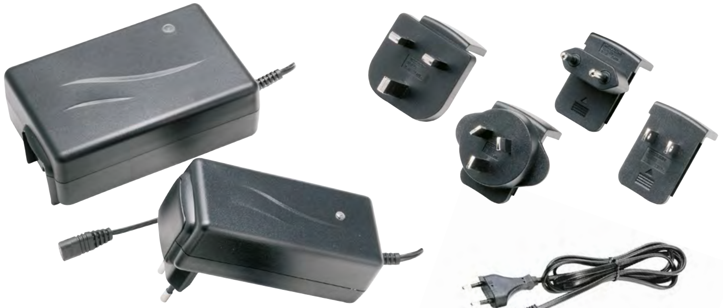
2-pin IEC 320 C7 mains cord 1800 mm EU part no. 131306 UK part no. 131148, US part no. 131368, AU part no. 013108

For 2241 only: Exchangeable AC plug models